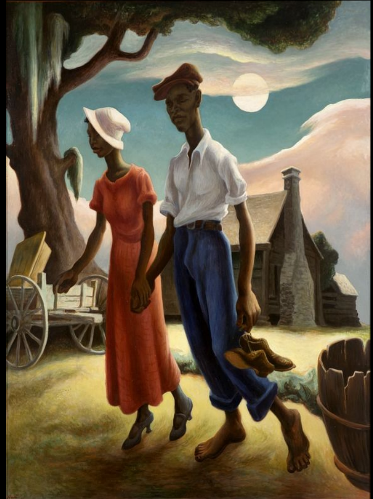
Thomas Hart Benton, Romance