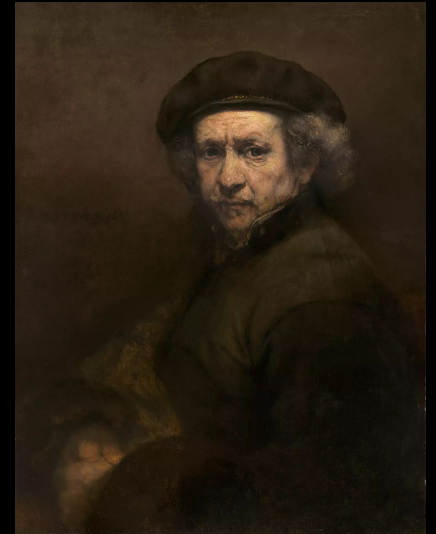
Rembrandt's self-portraits through the years