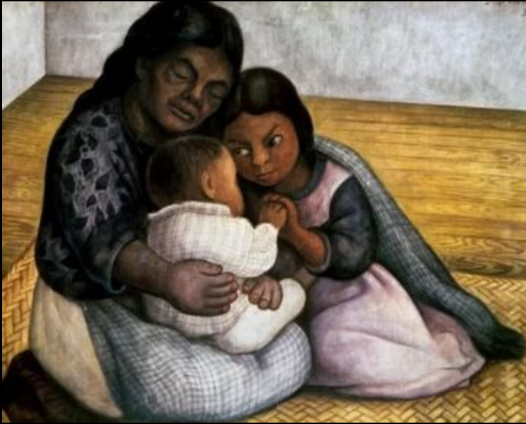
Diego Rivera, Mother and Children