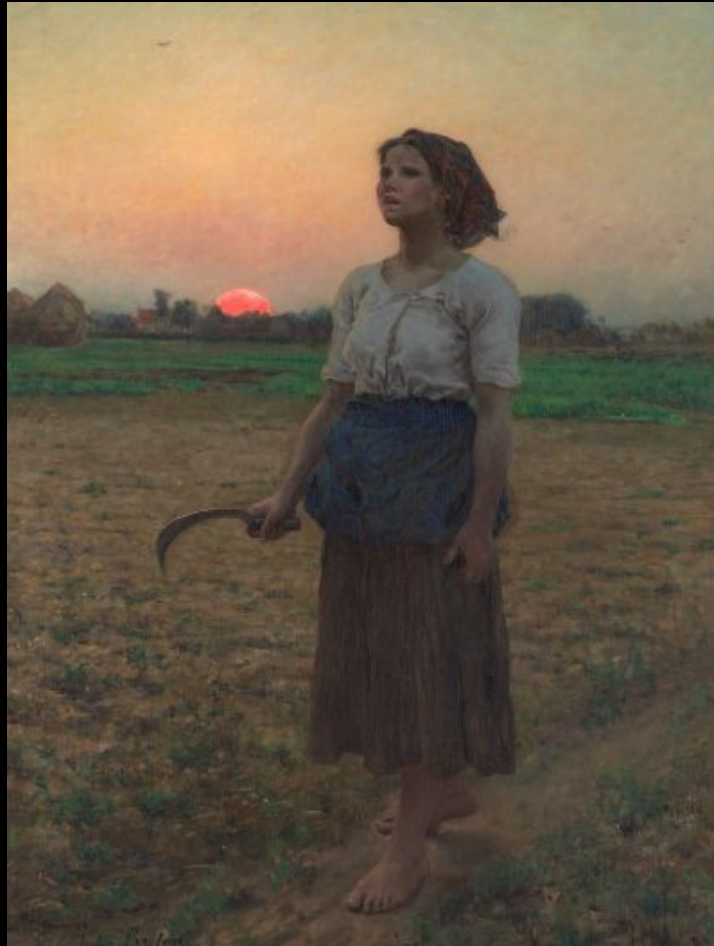
Jules Breton, The Song of the Lark