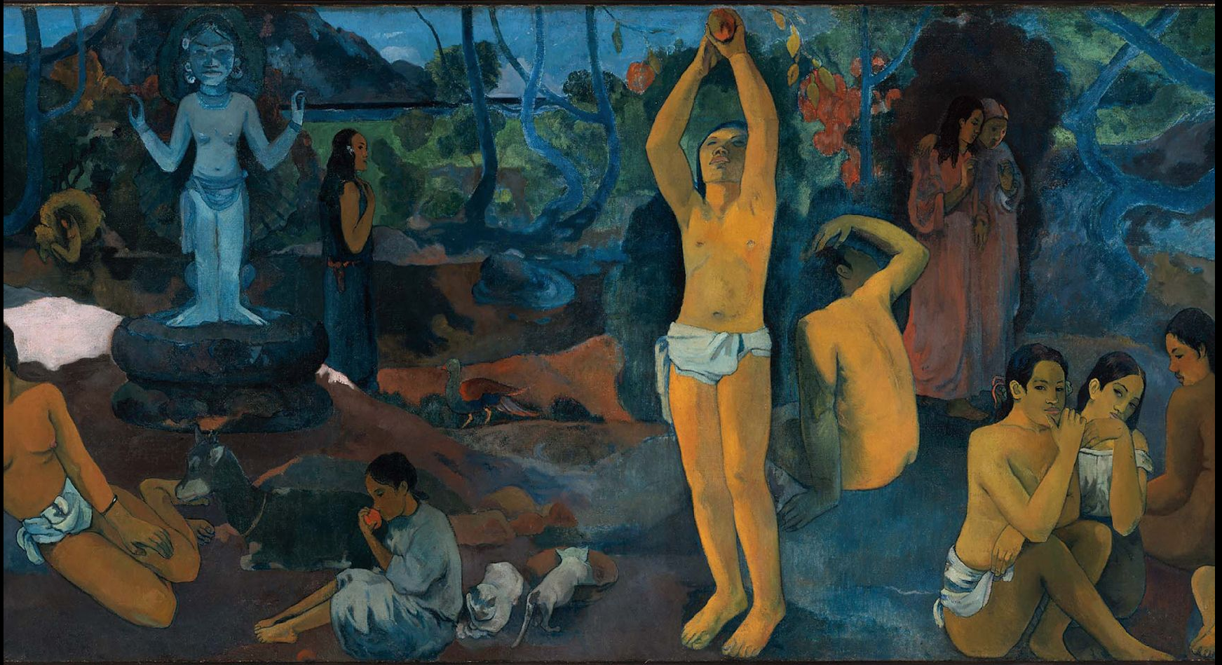
Paul Gauguin, Where Do We Come From? What Are We? Where Are We Going?